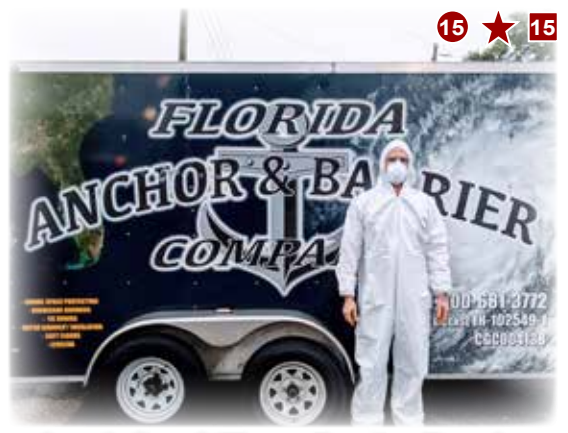
Insulation & Vapor Barrier Repairs Soft Floor Repairs & Laminate Flooring

Wishing you good health and safety, The Florida Anchor & Barrier Team